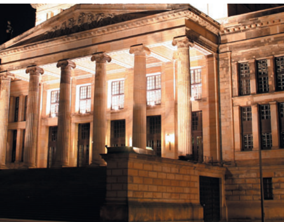
A symbol of elegant choice