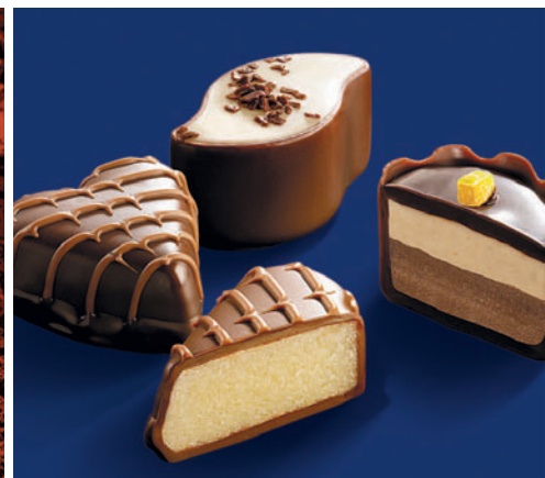
Collection of refined chocolates