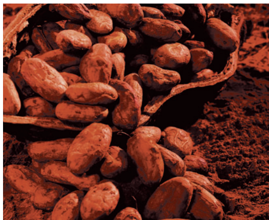
High quality cocoa beans from Cote d'Ivoire and Ghana